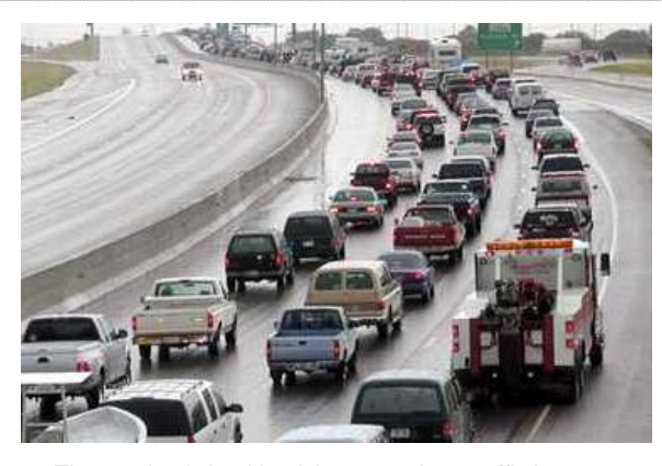
The pandemic health crisis causes long traffic jams as millions of motorists flee major cities for the safety of less populated, rural counties.

revealed that the region was in disarray as to how they were dealing with the quickly spreading, ever-expanding pandemic. Some of the more humane nations were rounding up the zombies, loading them on planes, trains and automobiles, delivering them to the border and then shoving them across to let their neighbor deal with them. Others were using guns, flamethrowers, tanks, bows, machetes and even sharp pointy sticks to maim, kill and otherwise destroy the infected portions of the populace. Other nations let the zombies be while collecting the greatest minds from around their nation in an effort to discover a cure. And still others did absolutely nothing at all. Those were the nations that were hit the hardest.