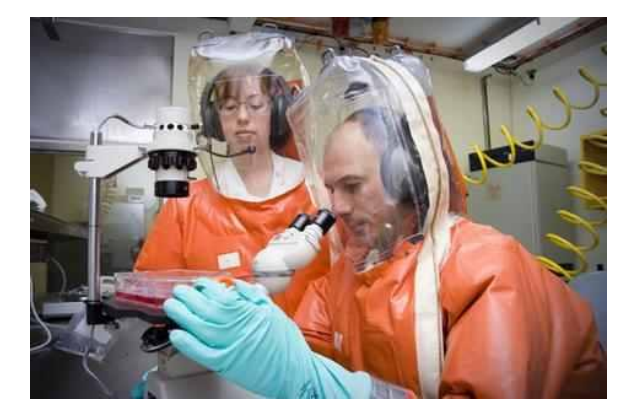
Infectious disease specialists analyze infected tissue samples to determine the nature of the pathogen and discover the proper antidote.

Zombies over the border also quickly fell out of favor after a few terse phone calls between national leaders of many Texas nations. Most of the ones we heard were of the variety, "If you chuck one more Zombie over that fence..." Wiser heads prevailed and that practice virtually disappeared. All that was left was a race for the cure.