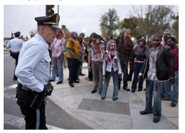
Lieutenant Frankie Lee assesses the situation on Main Street as hundreds of zombies slowly make their way towards the steps of NewAustin City Hall.

Big Tex immediately jumped on Lone Star One and jetted to the Capital in record speed to find everyone on High Alert and a newlycreated Texas Zombie Emergency Command Center set up right there on the front lawn. "WTF Hiram!" exclaimed the out-of-breath Governor to his Lieutenant Governor. "Zombies, Sir! Millions of them!" came the swift reply. A quick assessment of the situation