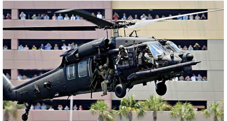
Texas Defense Force reservists arrive near a parking garage where hundreds of citizens were left stranded after seeking shelter from a horde of zombies.