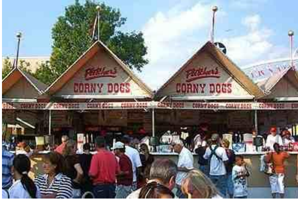
10KIslanders were treated to an assortment of fried foods including fried bacon, funnel cake, fried spaghetti and meatballs, fried butter and corny dogs!

Friday, November 1 — The Fair of Texas reached a record breaking number of visitors as 10KIslanders stopped by for a weekend visit.