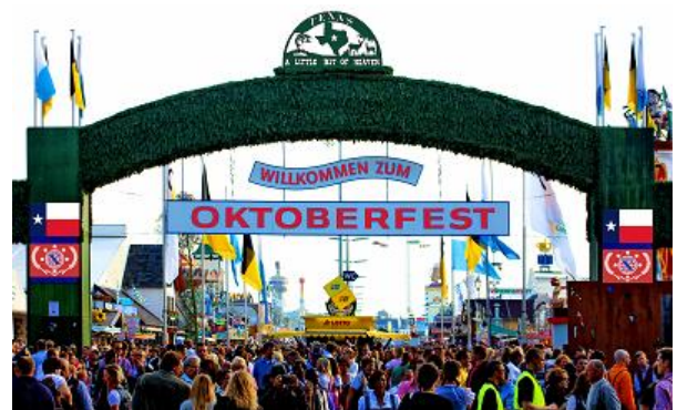
10KIslanders celebrate Oktoberfest in Texas with plenty of fräuleins und bier, polkas, fräuleins und bier, wüerst, and did I mention fräuleins und bier?