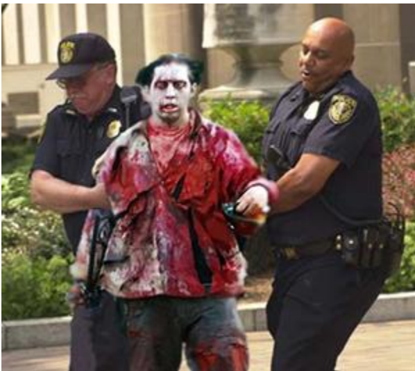
Police remove a zombie from the NewAustin City Hall. Several government and school buildings went into lockdown moments after the outbreak occurred.