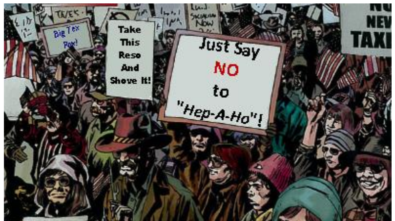
General Assembly Resolution "Legalizing Prostitution" - NewTexas

Commend Naivetry - For Condemn Thatcheron - Against Repeal "Liberate Free Thought" - Against Commend Glen-Rhodes - Against Condemn Macedonia - Against